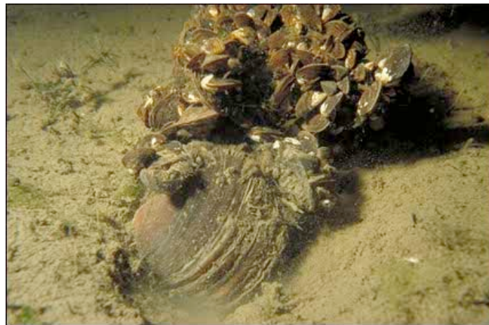
Zebra mussels ( Dreissena polymorpha ) attached to a native mussel.