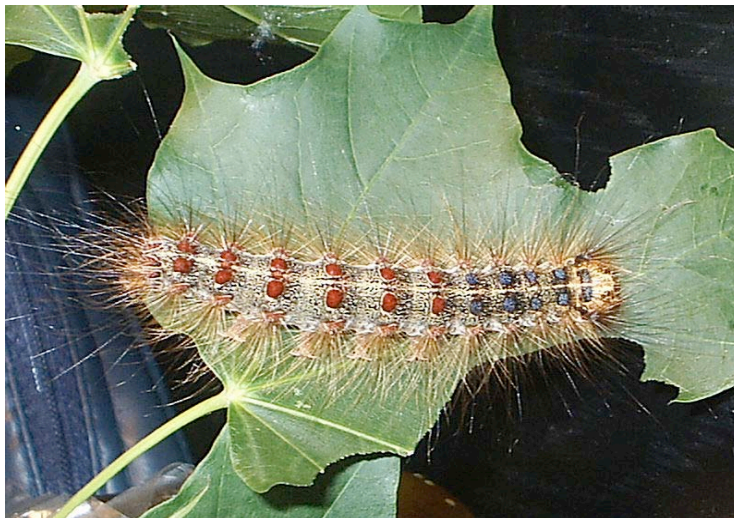
Gypsy-moth caterpillar ( Lymantria dispar ).

View the PowerPoint about asking open versus closed questions.