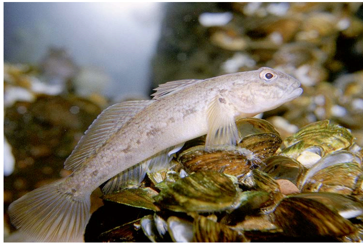
Round Goby ( Neogobius melanostomus).