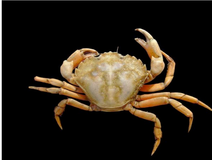
European green crab ( Carcinus maenas ).

4.1 Pick one of your open questions to be the subject of a report that you will prepare.