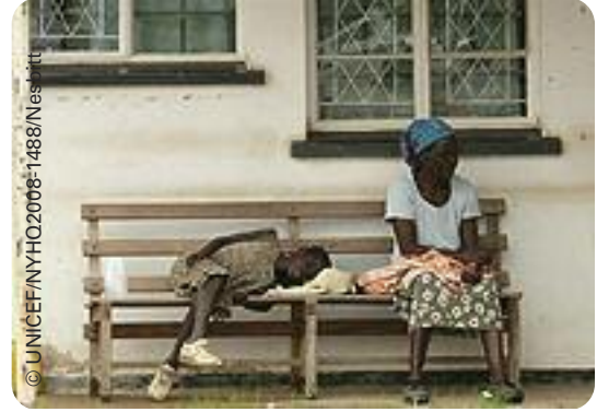
A girl rests beside an elderly woman on a bench as they wait to be treated for cholera, at a UNICEF-assisted clinic in Musengezi village, Zimbabwe.