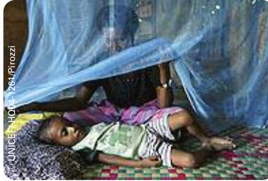
A woman unfurls an insecticide-treated mosquito net over a child's bed in Papua New Guinea. UNICEF supplies bed nets as part of a community-based program that helps families implement sound maternal and early childhood development practices, including the use of insecticide-treated mosquito nets.

Using only eight numbers from the list below, fill in the blanks to complete the story of malaria. No number should be repeated.